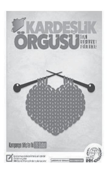
Figure 9: Weaving for brotherhood! We are weaving weal and muffler for our Syrian brothers/sisters.