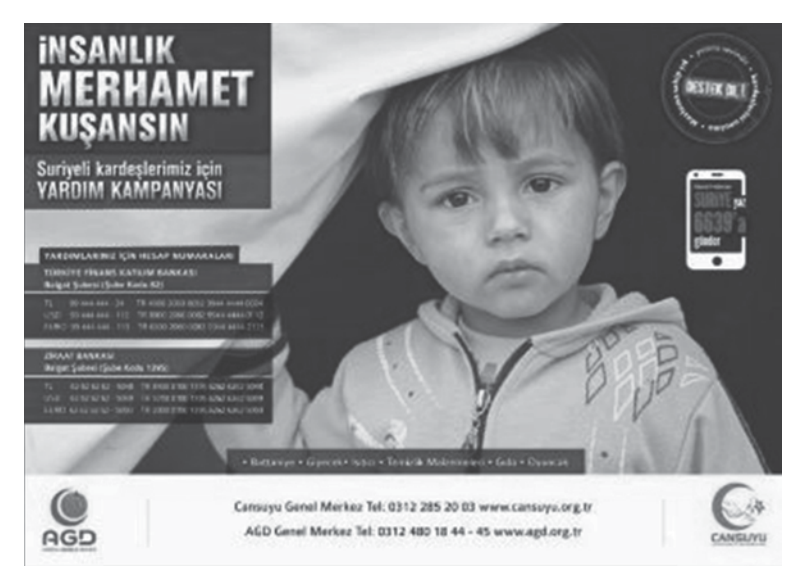
Figure 2. Humanity do wear mercy! Aid Campaign for our Syrian Brothers

Muhajir is a word derived from the word hijrah that is literally means "to leave a homeland and to migrate another land". In Islamic literature hijrah is being described by the emigration of first Muslims following the pressures from the leaders of Makka. They had migrated from Mecca to Abyssina and later to Medina in 622 AD. Historically, after the Muslims setting their states, the term gained different approach and has been expressed as abandoning what God has forbids.<sup>19</sup> After gaining independence of from colonizers, new nation states of Muslims brought different complexities. Modern structure of new Muslim nation states and tendency in secularization created different discussion and different new approaches in some terminologies. Dictator regimes of new Muslim states forced people for different pursuits. These initiatives had met with very harsh oppressions. Hama massacre in 1982, in Syria, is still very alive in the mind of Islamist