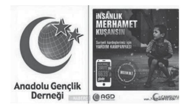
Figure 21: Humanity do wear mercy! Relief Campaign for our Syrian brothers and sisters.

The campaign, named as Farkındayım Yanı Başındayım - I am aware of you I am with you has been run in Ankara, Gaziantep, and Şanlıurfa. The Ministry of Education assigned 17 schools in which 12.978 benefited. In the website of the project launch it is stated that the values of the brother-hood of Ansar and Muhajir was the fundamental principle in launching the project. The aim of this approach has been explained as a tool to educate "our young brothers and sisters who take refuge in our country, hold their hand and launch projects that will allow them to meet knowledge and learning" (Farkındayım Yanıbaşındayım).