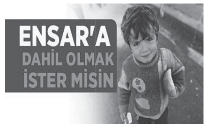
Figure 20: Do you want to be involved by Ansar

The campaign, named as Farkındayım Yanı Başındayım - I am aware of you I am with you has been run in Ankara, Gaziantep, and Şanlıurfa. The Ministry of Education assigned 17 schools in which 12.978 benefited. In the website of the project launch it is stated that the values of the brother-hood of Ansar and Muhajir was the fundamental principle in launching the project. The aim of this approach has been explained as a tool to educate "our young brothers and sisters who take refuge in our country, hold their hand and launch projects that will allow them to meet knowledge and learning" (Farkındayım Yanıbaşındayım).