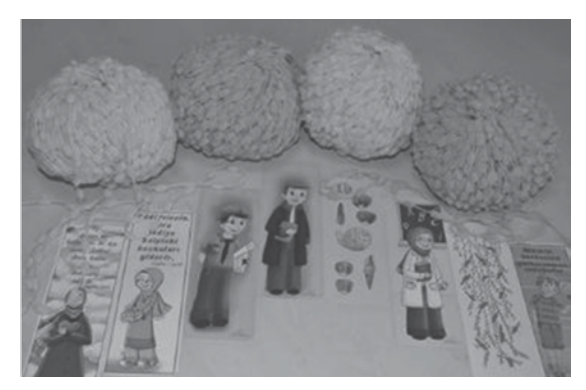
Figure 10: Bookmarks prepared and sold by university students to purchase equipment for weaving