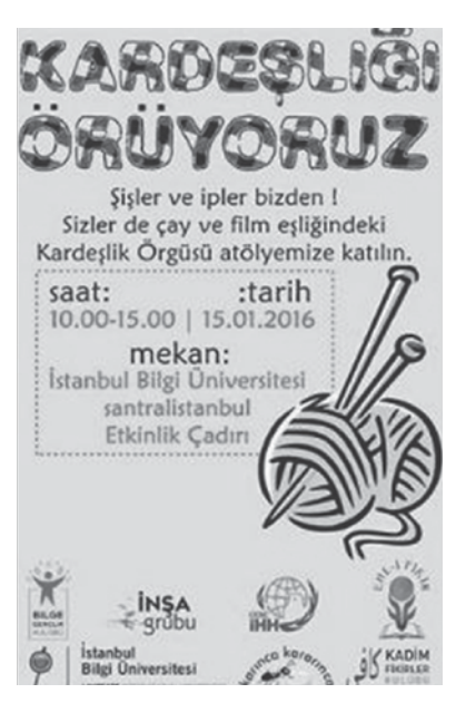
Figure 12: About announcement of the event which composes few social formations, in Istanbul Bilgi University

The project further stimulated individuals to improve some other ideas through social media and resulted forming a platform that collected two trucks of winter clothes.<sup>23</sup>