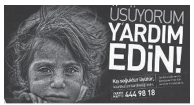
Figure 6: "I am freezing, help!" "Winter is cold and freeze but brotherhood of Istanbul warms. Help for our Syrian refugee brothers and sisters".