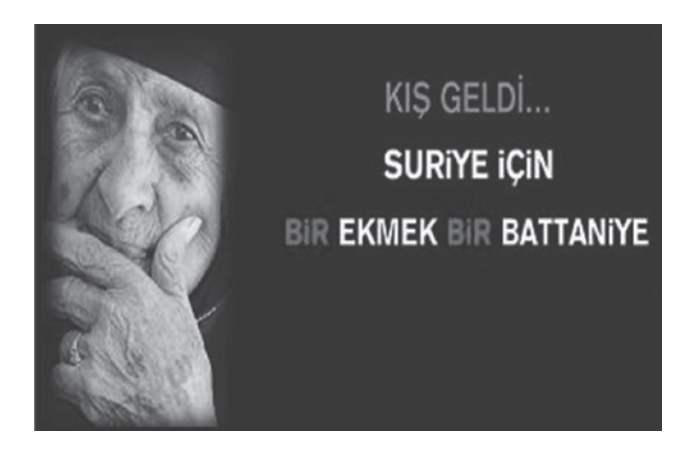
Figure 18: Winter came! A bread and a blanket for Syria!