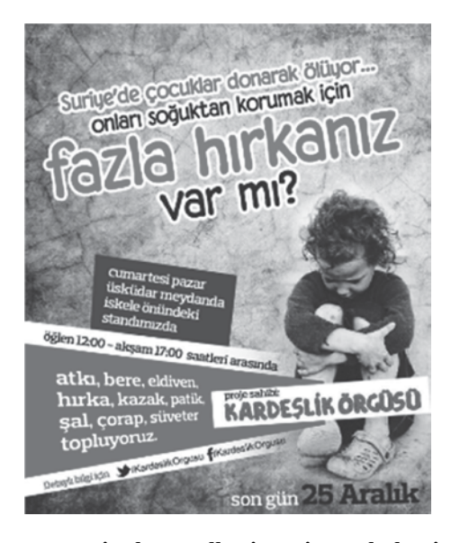
Figure 11: Announcement is about collecting winter clothes in Üsküdar square between certain hours of the day related too Weaving for Brotherhood.

The important detail about the project was that volunteers came together from different ages and even different countries. This has been an important contribution in fostering the idea of the "humanity for all" and for improving the sense of brotherhood and awareness about Syrians.