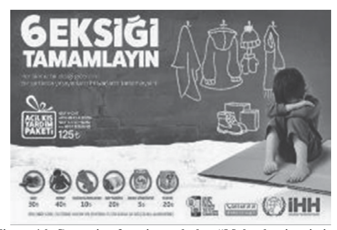
Figure 16: Campaign for winter clothes "Make the six missing"

for a friend, brother, neighbour, relative; we are as a nation going to save the mankind from being hostage". He stated that death of a human being in Syria means the death of all humanity" "death of our humanity". He again addressed the common consciences of the Turkish nation which responded earlier from the state and from any other public enterprises. These words are very inclusive and supportive.