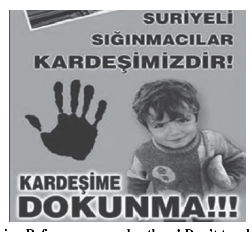
Figure 4: Syrian Refugees are our brothers! Don't touch my brother!