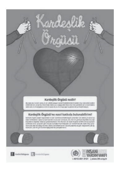
Figure 8: "The project aims to help a tiny bit our Syrian brothers and sisters who experience the war very painfully, to protect them from freezing colds of the winter and the most importantly to show that we never forget them and we will not allow the world to forget.