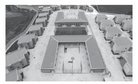
Figure 15: Final condition of the project