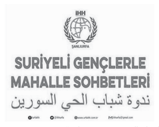
Figure 13: Announcement about "Neighborhood talks" with Syrian Youths

The platform composition of eleven NGOs and two individuals in Ankara aims to gather all activities and relief organizations to ensure coordination between those NGOs. According to the project organizers Syrians who are living in Ankara will be determined and their addresses will be collected in one particular software program. These families will be supported financially to ensure that they are able to send their children to the schools. Another aim is to determine professions of Syrian society in Ankara for future projects and coordination. Coordination between those NGOs is important in terms of preventing any chaos on the ground, work definition of each NGOs and involvement of civil society in the relief and cohesion process. <sup>28</sup>