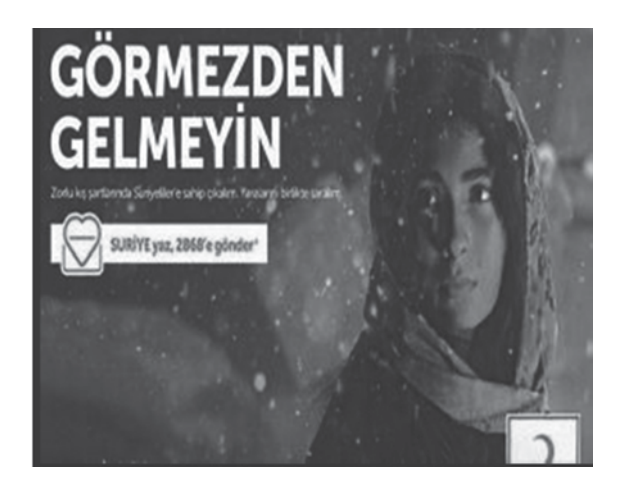
Figure 5: Do not ignore! Let's look after Syrians who are under difficulties and let's together heal their wounds