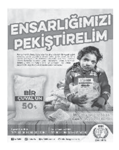
Figure 3: "This is a call for flour relief; Let's consolidate our being ansar"

The argument, for this usage, is to avoid applying a western term with all its connotations on the Syrian people as it projects a sense of statelessness and humiliation. The understanding that these people fled their country because of oppression and because of an assault on their Islamic identity, is a very important determinant in this usage.