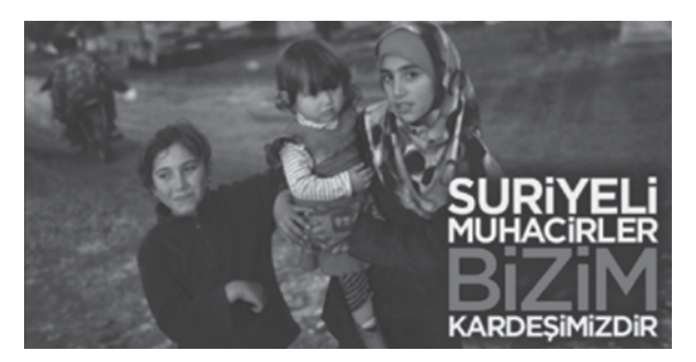
Figure 1: Syrian muhajirs are our brothers and sisters

Relief campaigns are important carriers of messages and serve as tools to accomplish what is being targeted. In fact, there is a need for a professional focus for the campaigns in terms of capability in reaching a wide audience. Scientific measurements of the effects of campaign discourses and visuals in presenting Syrians to the society can yield significant results. Whilst most of the visuals contain of images of women and children, the basic message is to display the vulnerability and disadvantageous conditions of the people. While the "helplessness" mobilizes the public more in raising awareness and assistance, this situation may be coded in the minds that Syrians always "deprived and needy", causing us to ignore the potential of contribution to Turkey. Appreciation of those qualified Syrian population would ease social acceptance and cohesion.<sup>15</sup>