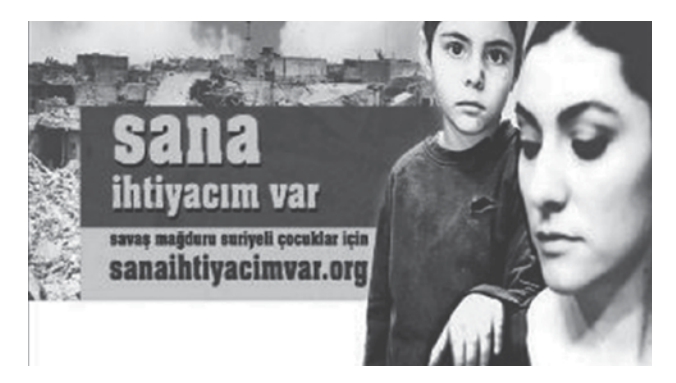
Figure 17: Campaign visual of "I need you"