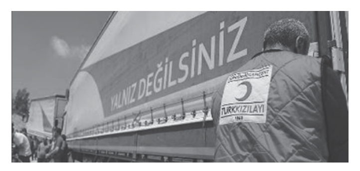
Figure 19: Turkish Red Crescent relief truck which is covered with word that "you are not alone"