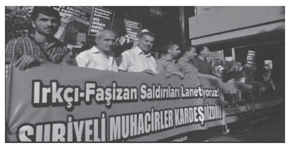
Figure 7: Protest about attack and discourses against Syrians