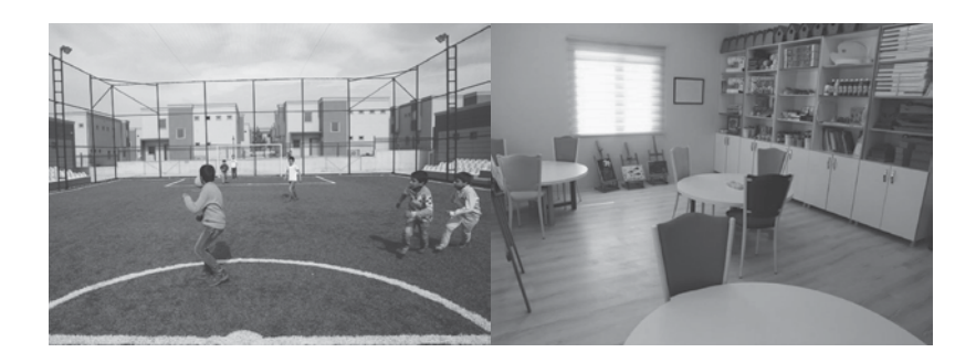
Figure 14: Final condition of the project

Recently there are very impressive projects are under preparation such as the Children Living Center which has been built in Reyhanlı, district of Hatay. The center has been designed by professional architects with the aim of providing a warm environment rather than hosting the children and their mothers in the shelters. Almost 990 children who are the victim of ongoing war will be accommodated with their mothers in the complex.<sup>33</sup>