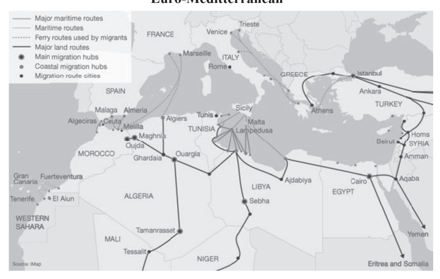
Figure 2: Major Migration Routes and Hubs around the Euro-Meditterranean<sup>25</sup>

nean borders of the EU. In 2013 Syrian refugees constituted 25 percent of the detected passages across the Libya-Italy sea border.<sup>23</sup> Before the `Arab spring` the passages through Mediterranean borders were regulated under smooth border security and remote control strategy negotiated among the EU and North African countries under initiatives for Partnership for Democracy and Prosperity Shared with the southern Mediterranean. Valetta Summit is the most cited initiation in this regard. Most of these initiatives did not stop the smuggling as well as trafficking through the Central Mediterranean, but led to a shift towards dangerous and expensive routes that resulted in more deaths at the border zones, deserts, and human traffickers' hubs.<sup>24</sup>